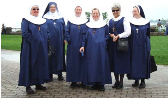
Outing to "the Falls".

On September 14th, The Exaltation of the Holy Cross and the eighth anniversary of its Founding, members of the Community boarded the shuttle buses taking them to the airport.