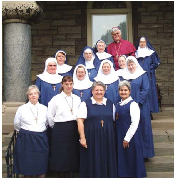
SSC at Chapter 2008 with their Bishop Visitor.

Last September the Sisters of The Servants of the Sacred Cross (SSC) met together at Mount Carmel Spiritual Centre in Niagara Falls, Ontario for their annual General Chapter. From September 7-14th, Sunday to Sunday, the Sisters held their official annual Chapter meeting, shared in worship and fellowship and celebrated various Community Rites.