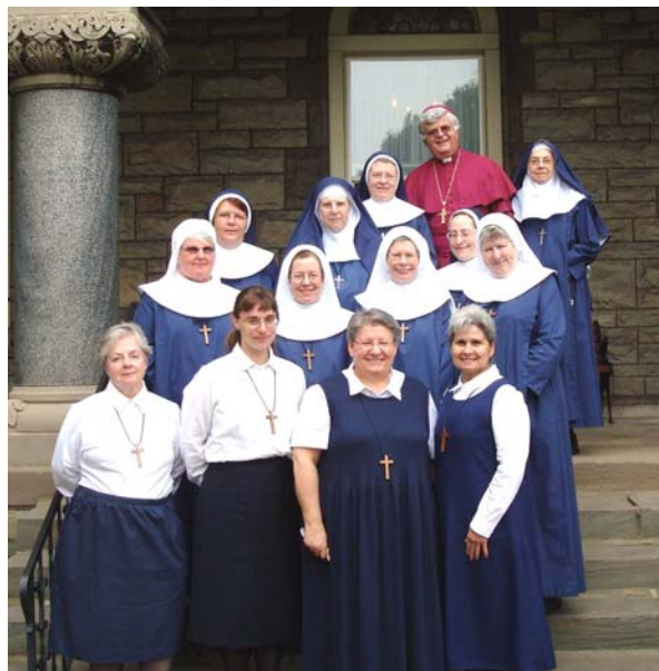
SSC at Chapter 2008 with their Bishop Visitor.

Last September the Sisters of The Servants of the Sacred Cross (SSC) met together at Mount Carmel Spiritual Centre in Niagara Falls, Ontario for their annual General Chapter. From September 7-14th, Sunday to Sunday, the Sisters held their official annual Chapter meeting, shared in worship and fellowship and celebrated various Community Rites.