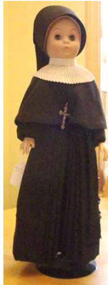
Doll dressed in the habit of the Holy Family of the Nazareth.

the family home to enter the convent. A charming example is the doll dressed by the Sisters of Saint Casimir, a community organized in the early 19th century to serve Lithuanian immigrants in America.