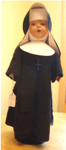
Convent dressed doll in the habit of the Sisters of Saint Casimir.