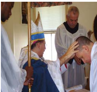
"Take thou authority to execute the office of a Deacon in the Church of God...."