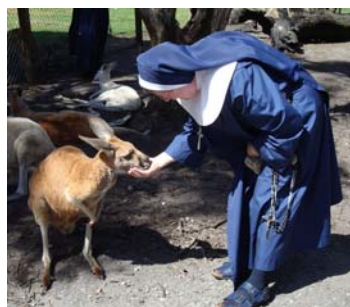
.....and a Kangaroo!!