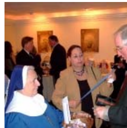
At Mother's Care benefit dinner