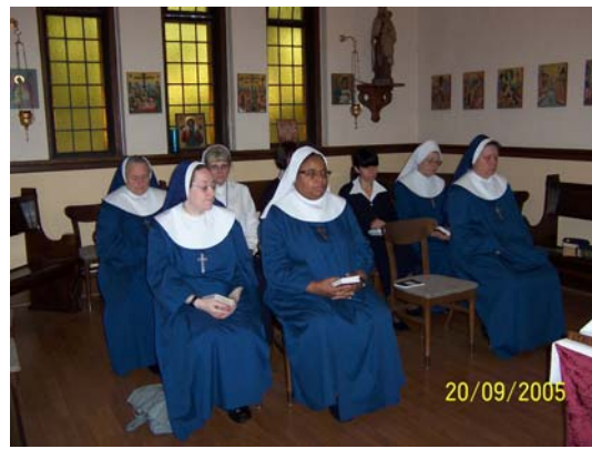
In Chapel after praying the Divine Office