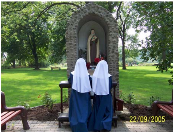
SSC Novices kneel in prayer at an outdoor shrine.

The Sisters of the Servants of the Sacred Cross hold to the tradition of wearing a visible sign of witness and commitment. The habit is worn as a sign of membership in a religious sisterhood, in keeping with a tradition that is centuries old. The habit is a mark of belonging and serves to remind the one who wears it that she represents her Community and, by extension, the Church. The Sisters are both married and single women. They are not, by definition, nuns. They live and work in their own homes, communities and parishes. God willing, we pray we might also have Sisters living in a convent one day.